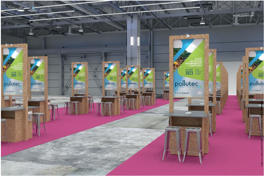
2023 Start-up area simulation