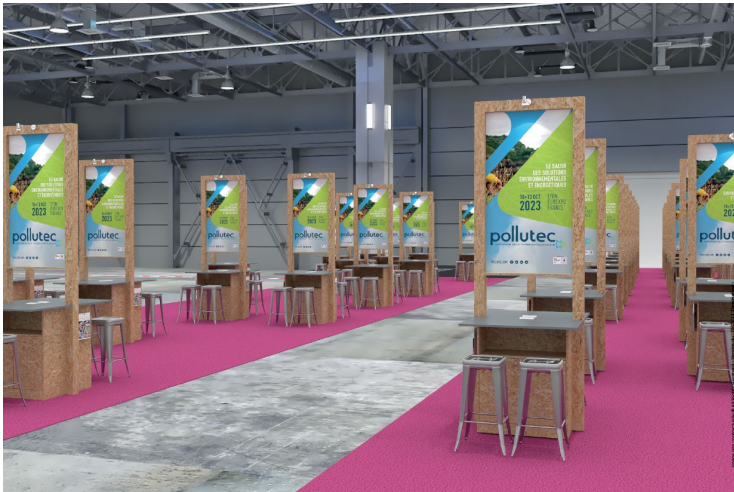
2023 Start-up area simulation