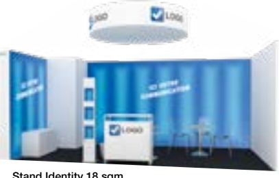
Stand Identity 18 sqm