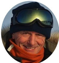
Jean-Louis Étienne Doctor, Explorer PolarPod Expedition 2025